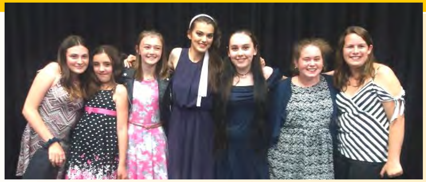
Student performers at the recent Sounds of Summer Concert

Axe Valley Academy Newsletter: Friday 20th July 2018 - Issue 6