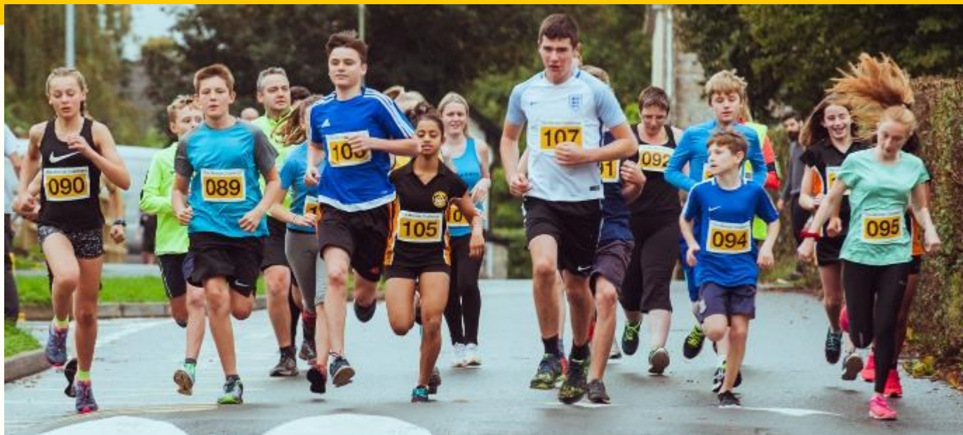
Runners setting off on the 5k Minster Run Challenge

Axe Valley Academy Newsletter: Monday 9th October 2017 - Issue 1