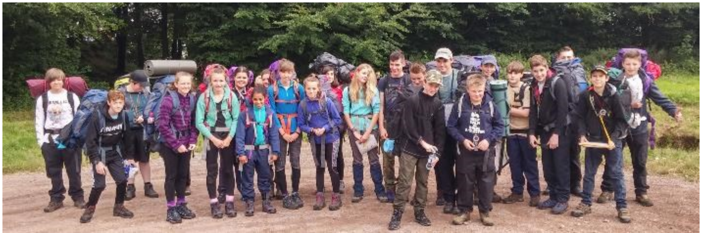
The DofE Group at the practise event last year.