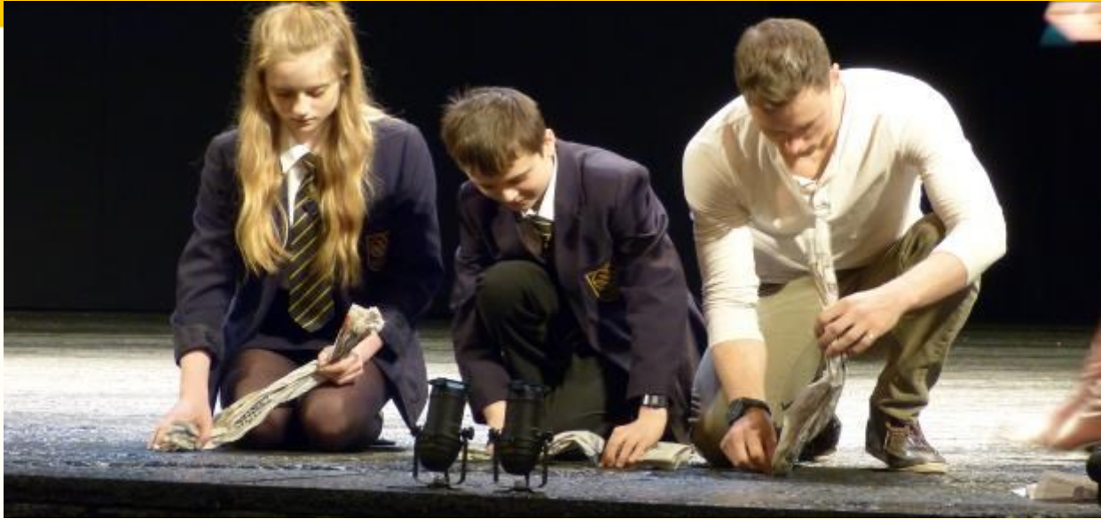
ASPRE students on stage with a member of the cast of War Horse learning the principles of puppetry.

The Axe Valley Community College Newsletter: Friday 6th February 2015 - Issue 9