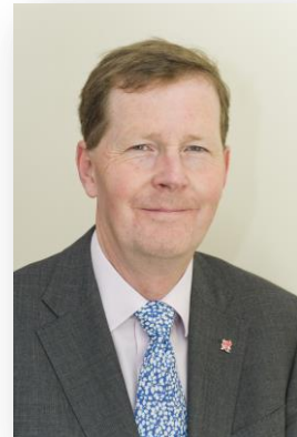
Trust Appointed Vice-Chair of Governors