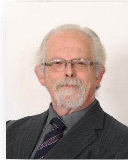
Trust Appointed Chair of Governors

I was a teacher for 32 years, having trained as a biologist at the College of St. Mark & St John, Plymouth. I worked in two large comprehensive schools in west Berkshire, in a variety of roles, for fourteen years before returning to my Devon roots in 1998 to work as Deputy and then Headteacher at Colyton Grammar School.