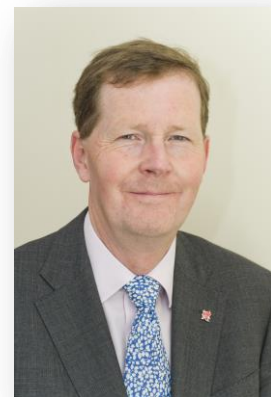
Co-Opted Vice-Chair of Governors