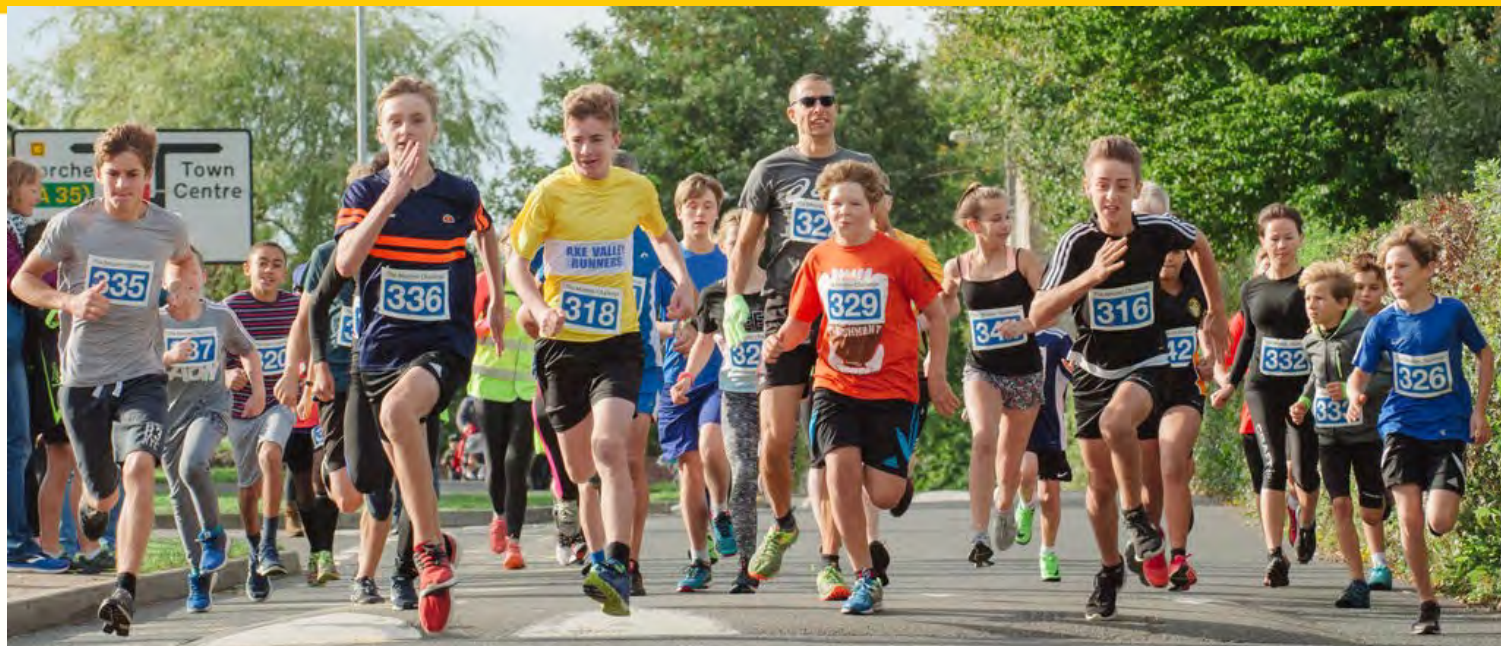
Competitors setting off for the 5K race at The Minster Challenge on Sunday 7th October

Axe Valley Academy Newsletter: Friday 19th October 2018 - Issue 1