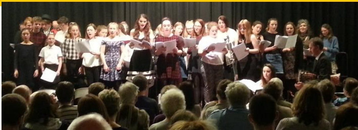
Axe Valley Academy Choir singing at the Spring Concert yesterday

Axe Valley Academy Newsletter: Thursday 29th March 2018 - Issue 4