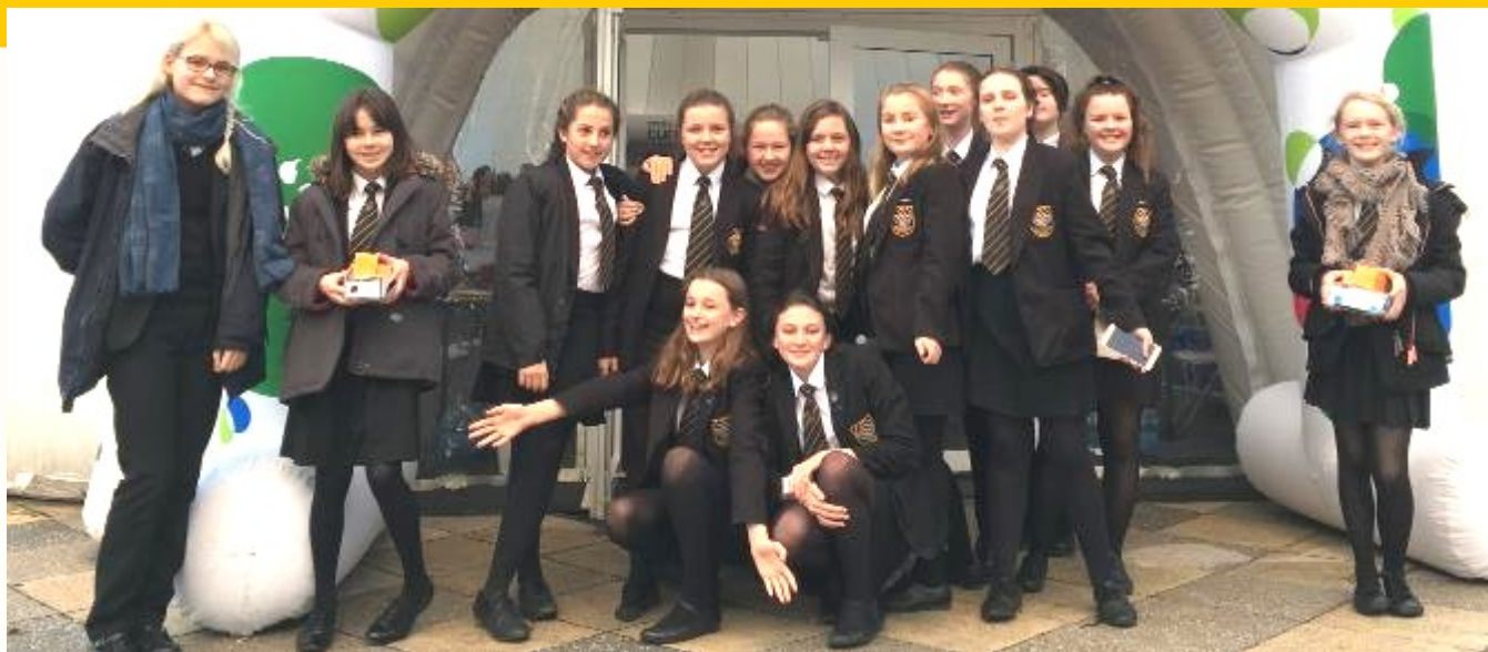
Year 8 and Year 9 girls at EDF sponsored STEM event at Exeter University

Axe Valley Academy Newsletter: Friday 1st December 2017 - Issue 2