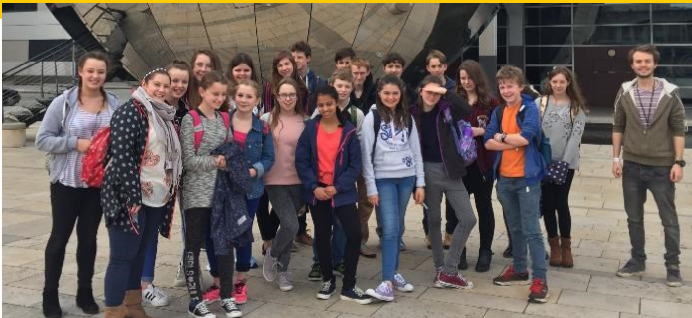
ASPIRE students visiting @Bristol interactive science centre

Axe Valley Academy Newsletter: Monday 1st May 2017 - Issue 7